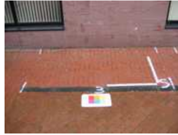
5 Weeks After Treatment